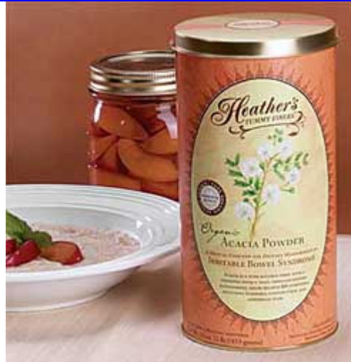
Certified Organic Acacia ~ Pure Soluble Fiber

~ Heather's Tummy Fiber ~ For the Dietary Management of Abdominal Pain, Diarrhea, & Constipation