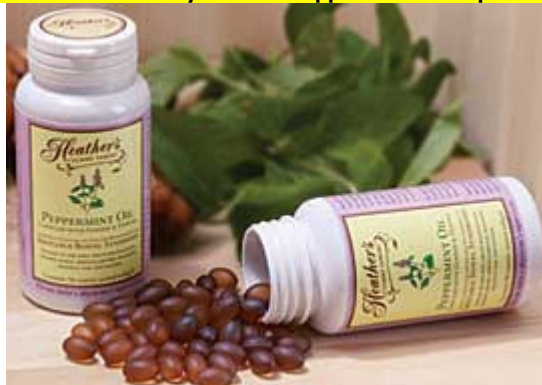
Peppermint Oil Caps Called "Drug of Choice for IBS"

Our Peppermint Oil Caps have the added benefits of fennel and ginger oils, and they help prevent abdominal pain, gas, and bloating!